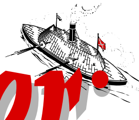
Monitor vs. Merrimack March 9, 1862, Hampton Roads, Virginia