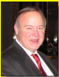
A Few Words From . . .